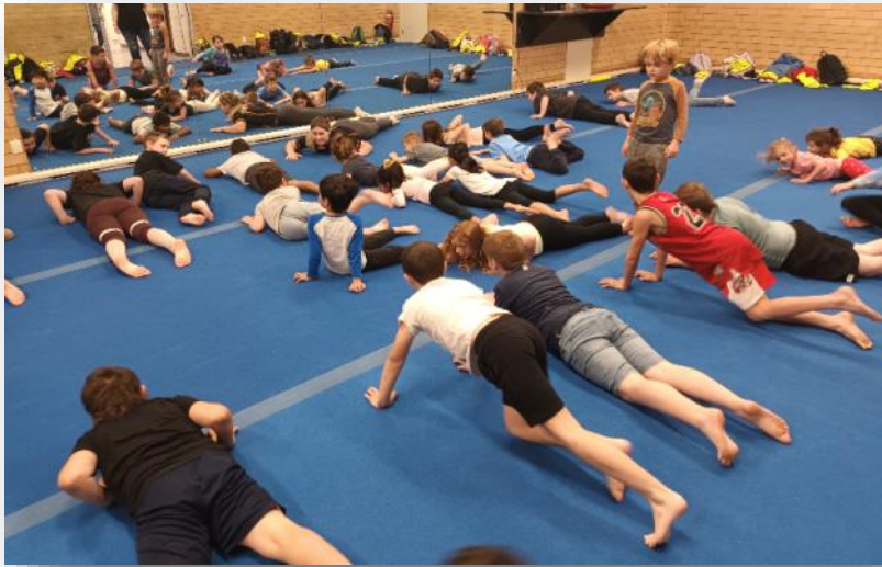
Warming up for gymnastics