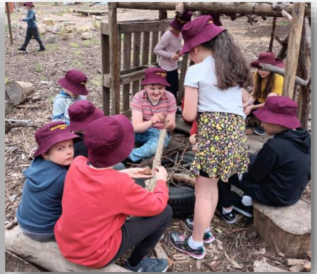
A little group pretending to have a camp fire during Nature play.