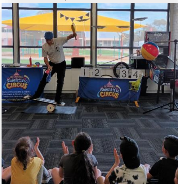
Dr Quark and the Scientific Circus

Our first day of October school holidays was a nice relaxing day in our PJs and watching movies. On Wednesday we went to AFL Max to use our energy, show off some of our footy skills, we did some rock climbing and even joined in some competitions. All the first week we had the Daytona machines and a pinball machine. We had a Daytona challenge on the Thursday before Dr Quark came to visit us with his Scientific